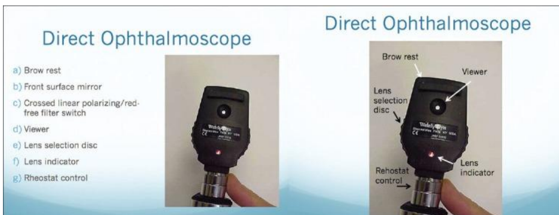
Figure 3- Left: Explanatory text is separated from the image. Right: Explanatory text is close to the parts being explained. This facilitates understanding and learning.